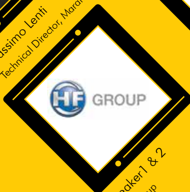
Speaker1 & 2 HF Group